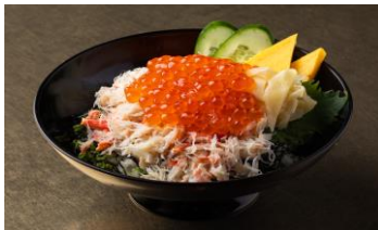
K05 Snow Crab and Ikura Don $26