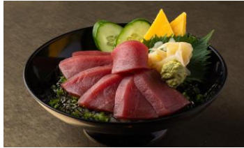
K01 Marinated Bluefin Tuna Don $29