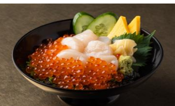
K11 Hotate and Ikura Don $26