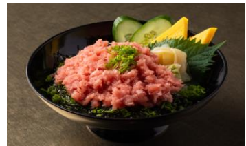
K06 Negitoro Don $20