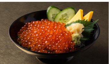
K12 Ikura Don $29