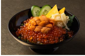
K14 Uni and Ikura Don