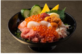
K13 Deluxe Kaisen Don