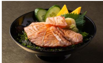
K08 Aburi Salmon Don $20