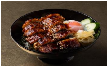
K17 Unagi Ontama Don