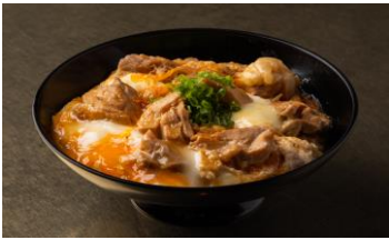
K16 Oyako Don