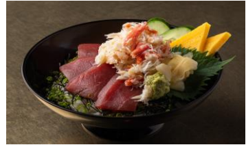
K03 Marinated Bluefin Tuna and Snow Crab Don $28