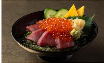
K02 Marinated Bluefin Tuna and Ikura Don $30