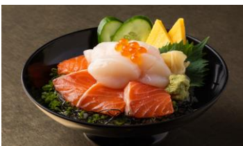
K10 Salmon and Hotate Don $20