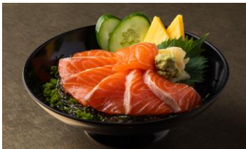
K07 Salmon Don $20