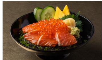
K09 Salmon and Ikura Don $24