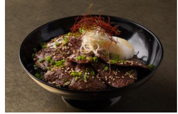
K15 A4 Kagoshima Wagyu Beef Yakiniku Don