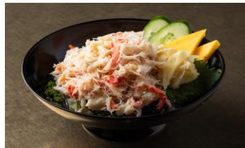
K04 Snow Crab Don $20